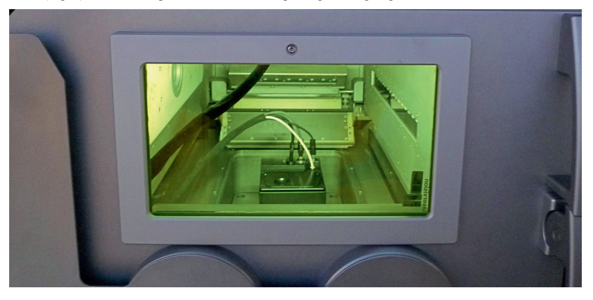
Fig. 2. Production chamber of an SLM system at the Fraunhofer IAPT

Measuring lasers in additive manufacturing places special demands on the instruments. For one, the fine metal powders used mean that the environment is never really dust-free; this affects both classical measuring instruments and the optical systems themselves. Furthermore, processing takes place in closed production chambers (Fig. 2), which often provide little room for placing and aligning additional measurement devices.