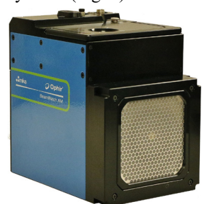
Fig. 1. Ophir BeamWatch AM is especially developed for the use in selective laser melting processes.

Five years ago, Ophir, a brand of MKS Instruments, introduced the BeamWatch technology for non-contact measurement of laser beams. For the first time, it was possible to measure the beam profile of high-power lasers without any restrictions on the power. As the laser beam passes through the instrument's housing, the beam parameters are determined indirectly by measuring the Rayleigh scattering. Inside the measurement system, the electric field of the laser radiation induces oscillation in the dipole molecules of the ambient air – or a process gas – at the laser's frequency, creating a corresponding elastic scattering. This can then be measured with a CCD or CMOS camera, and an integrated software calculates the beam and beam-quality parameters. Over the past few years, the company has adapted the technology to various areas of application. For example, BeamWatch AM was developed specifically for use in SLM systems (Fig. 1).