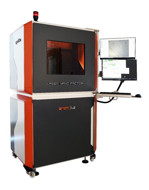
Fig. 1. "Laser Nanofactory" workstation used in this work.

paired with optical system capable of sustaining first three laser harmonics (1030 nm, 515 nm and 343 nm) as well as capable of dynamically tuning polarization and laser beam diameter. Fabrication is realized using synchronized linear stages and galvo scanners which allows stitch-free fabrication of cm sized structures. Other features such as real time imaging of the fabrication process is also realized. More details on the technical aspects of the system can be found in Jonušauskas et al. (2019). The system is controlled by the proprietary 3DPoli software.